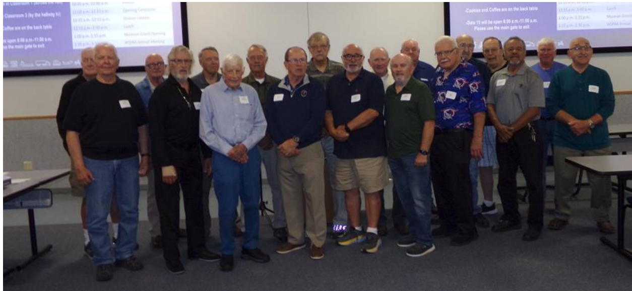
Sworn personnel classes 1 through 25