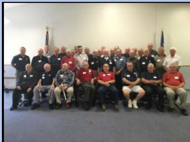
Recruit Classes 1 through 20