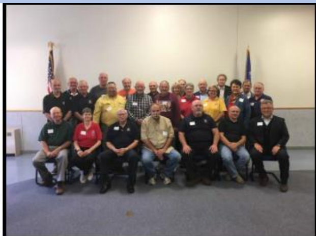
Recruit Classes 21 through current