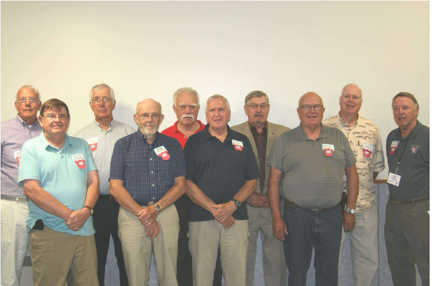
MEMBERS OF THE 14TH RECRUIT CLASS ATTENDING: (L-R)