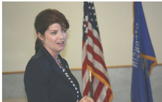
Lt. Gov. Rebecca Kleefisch addresses the assembly.

The Lt. Governor and Governor are very proud of the service and capability of the Wisconsin State Patrol.