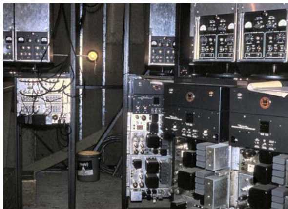
Microwave equipment at Chilton Tower