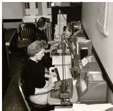
Enforcement Division Records Section, keying in citation and accident information—early 1960's