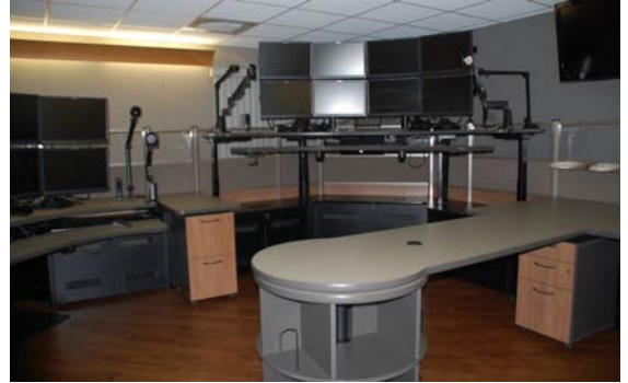
Eau Claire Comm Center showing a dispatch desk in the raised position (prior to touch screens and other equipment being installed)

The new Watson dispatch furniture is specifically designed for 24/7 use and provides ergonomic features our previous furniture couldn't offer. The monitor and keyboard surface at each desk can be independently raised/lowered giving the option to sit or stand while dispatching. Also included are dimmable LED task lights, cooling fans and heated floor mats as well as technology features for equipment and cable management. Each desk also has eight 22" LCD monitors enabling each desk to be fully functional (reducing shared computers) and two touch screen monitors that allow both the current and new radio systems to be in place for training/transition purposes.