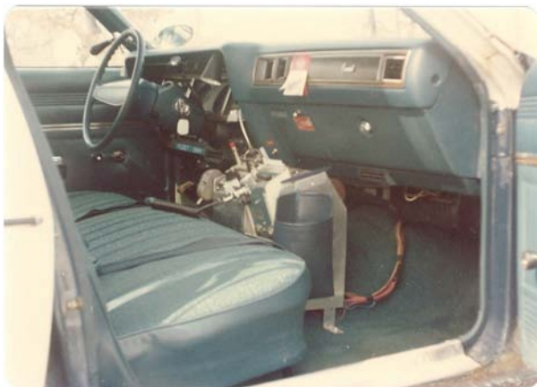
1976 Dodge with minimal radio equipment