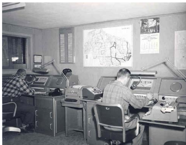
Madison central comm center