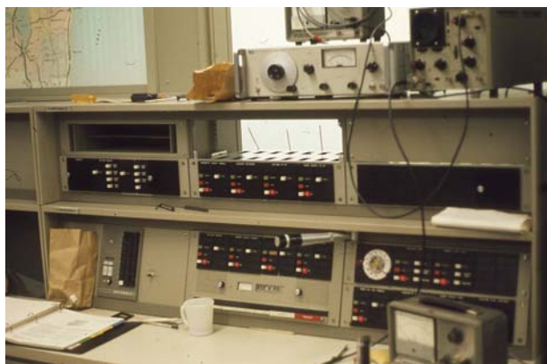
Typical Motorola radio console (1970-80's vintage)