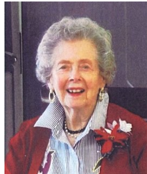
Christmas gathering Dec. 2011