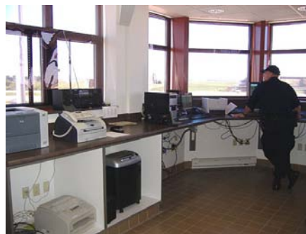
Inspector Operations Area