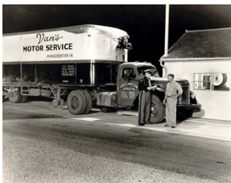
Dickeyville Scale 1953