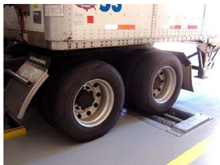
Brake Test Roller