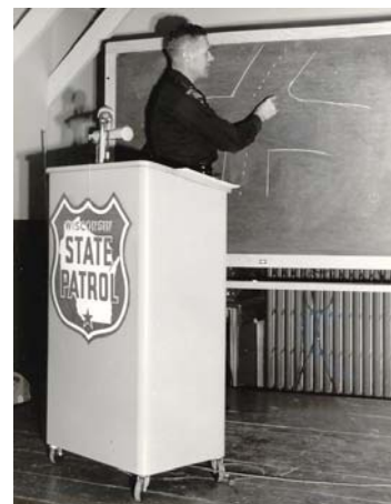
Traffic Crash Investigation Training