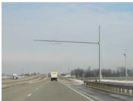
Mainline Weigh in Motion and Pre-Pass Communications Tower